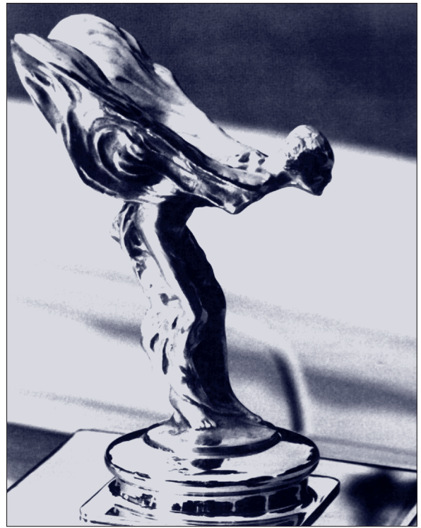
While originally part of the radiator cap, the Rolls-Royce “Flying Lady” mascot hood ornament has features suitable for simultaneous protection as a registered trademark, a copyrighted sculptural work and a patented design.

This pamphlet summarizes the principal attributes of these various types of protection.